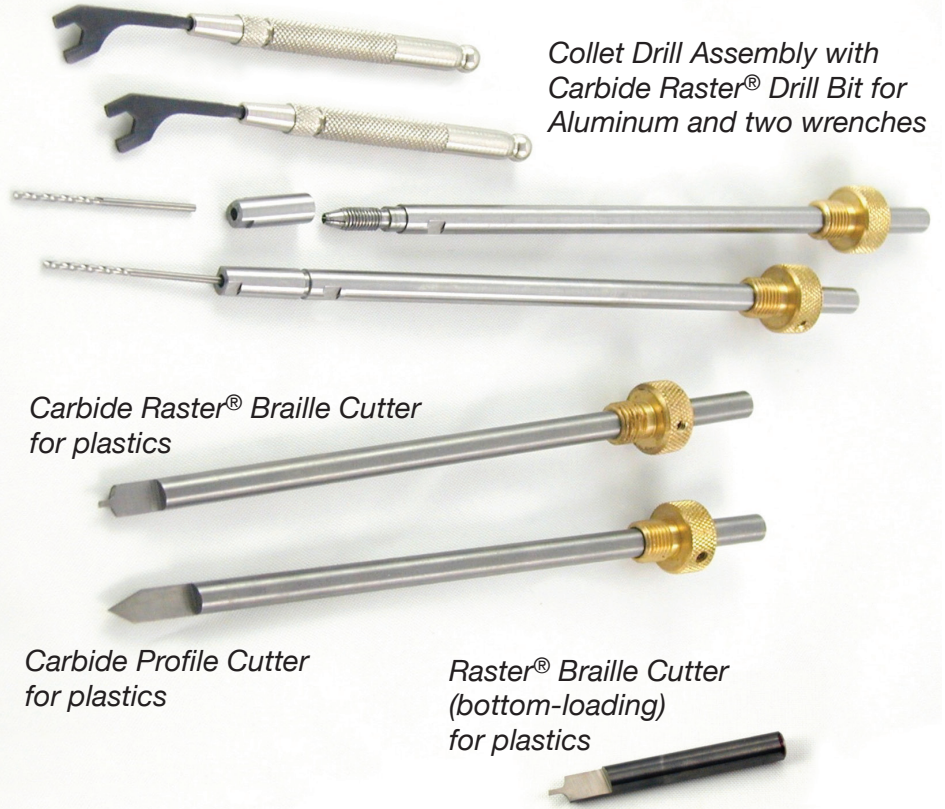
Collet Drill Assembly with Carbide Raster® Drill Bit for Aluminum and two wrenches